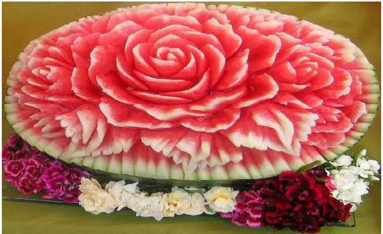
Rangoli with flowers and fruit carving