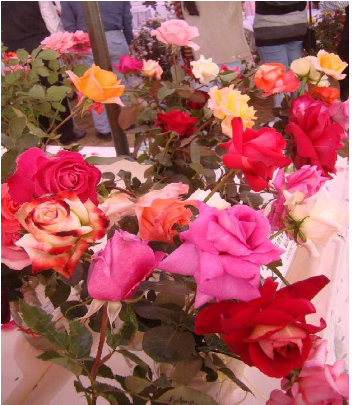
Cut Roses at a glance