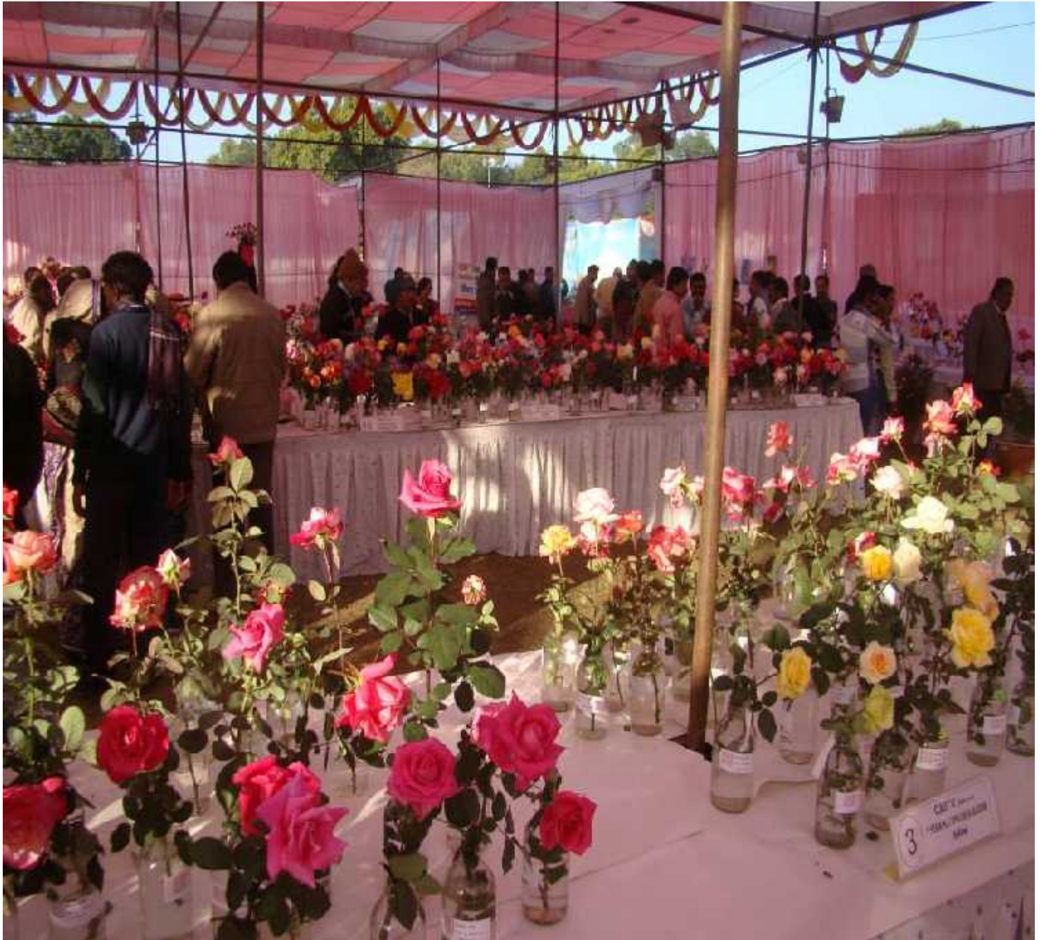
A glimpse of the exhibition hall

Images of Jabalpur Rose Show held on 17 th & 18 th of January - 2015. The Rose Society of Jabalpur.