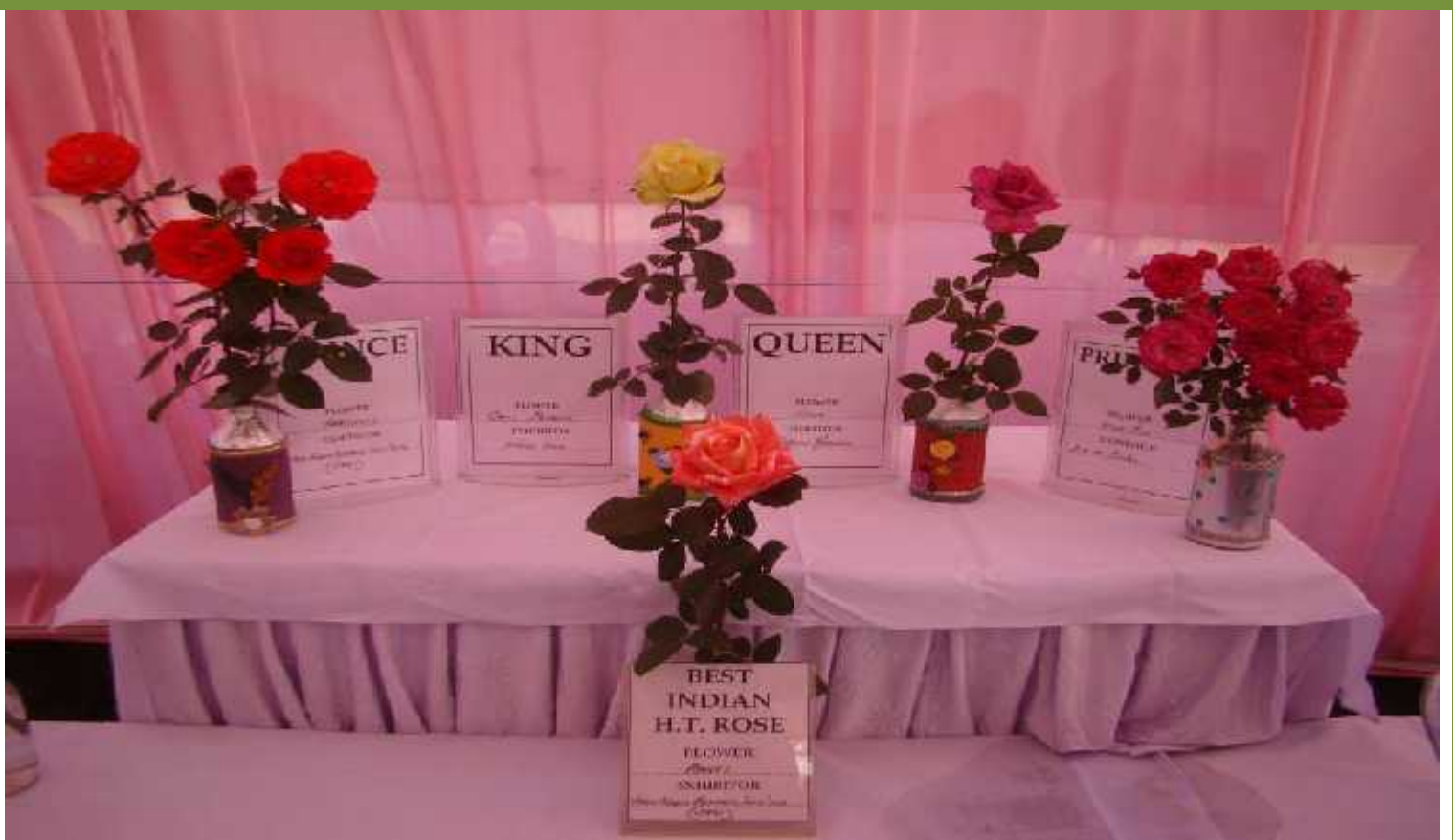
The Proud Winners