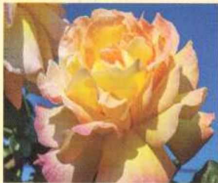
Mme A. Meilland

Today, 'Peace' is also known as 'Mme A. Meilland' in France, 'Gioia' in Italy and 'Gloria Dei' in Germany. It is estimated today as more than 100 millions plants of 'Peace' have been planted in the whole world.