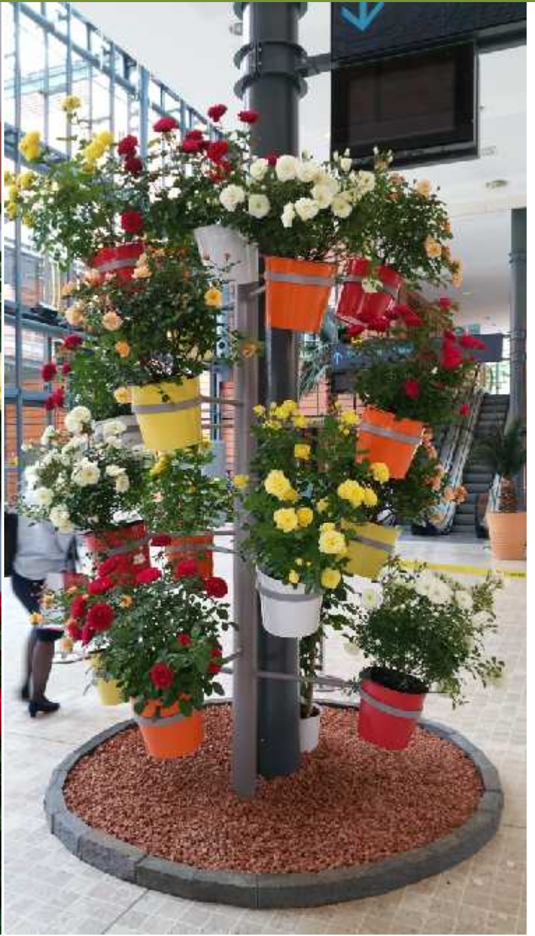
Exhibits on display at the Lyons Show