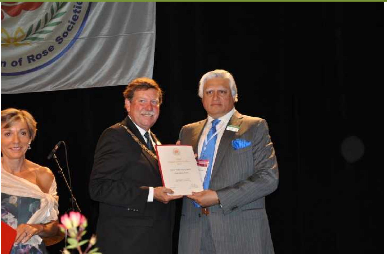
Being Conferred with the Garden of Excellence Award at Lyons