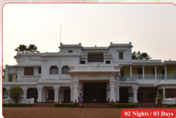
Shantiniketan - The land of nature and Tagore