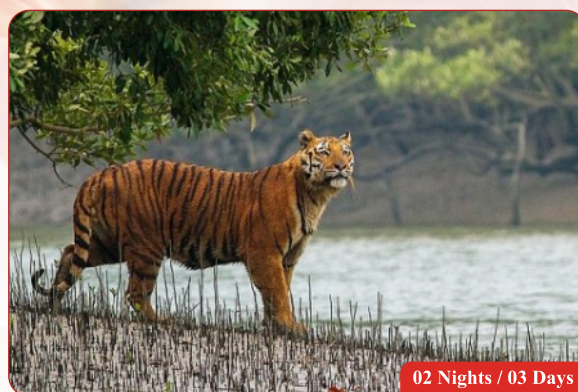
The Sunderbans - Wildlife Tour from Kolkata