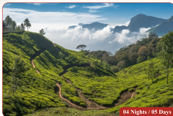
Himalayan Tour - Darjeeling and Gangtok